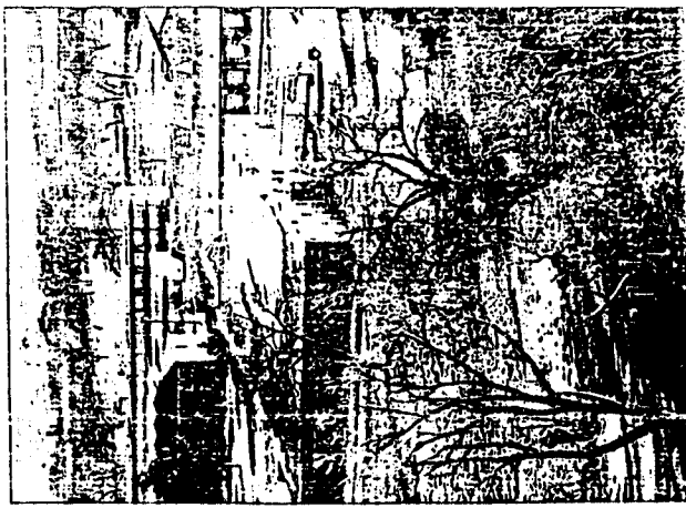
Part of the huge new 80-building Narconon facility in Oklahoma.