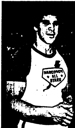
DUPED by the cult was "Incredible Hulk" star Lou Ferrigno.