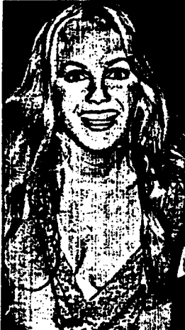
BLONDE Charlene Tilton of "Dallas" was on the list of stars.

Catherine Bach of "Dukes of Hazzard," John Davidson, Phyllis Diller, Gregory Harrison of "Trapper John, M.D.," Hal "Barney Miller" Linden, former heavyweight champ Ken Norton, Susan Richardson of "Eight Is Enough," Elvis Presley's former girlfriend Linda Thompson, writer-actor Mickey Spillane, Tanya Tucker, Fran Tarkenton, Charlene Tilton of "Dallas," Herve "Tattoo" Villechaize, Ralph Waite of "The Waltons," Henry "The Fonz" Winkler, Greg Evigan of "BJ and the Bear," Ron Howard, former star of