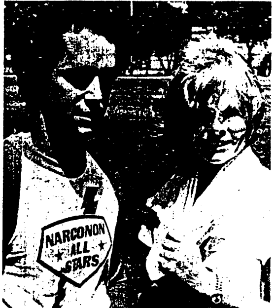
"NARCONON ALL STARS" Gregory Harrison of "Trapper John, M.D." and Cathy Lee Crosby at baseball game sponsored by the Scientology front.

Narconon charges drug addicts "outrageous" fees for