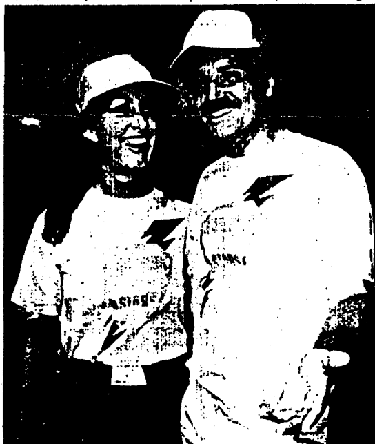
"BARNEY MILLER" star Hal Linden and Linda Thompson took part in Narconon fund-raiser.