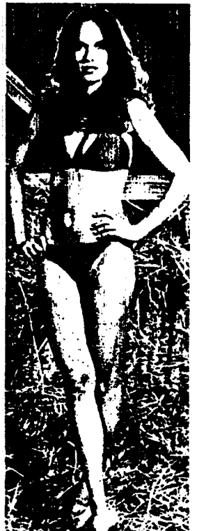
CATHERINE BACH of "The Dukes of Hazzard" had name on list.

treatment, the informant revealed. There are four stages of treatment at Narconon centers — starting at $630 and reaching at least $3,500.