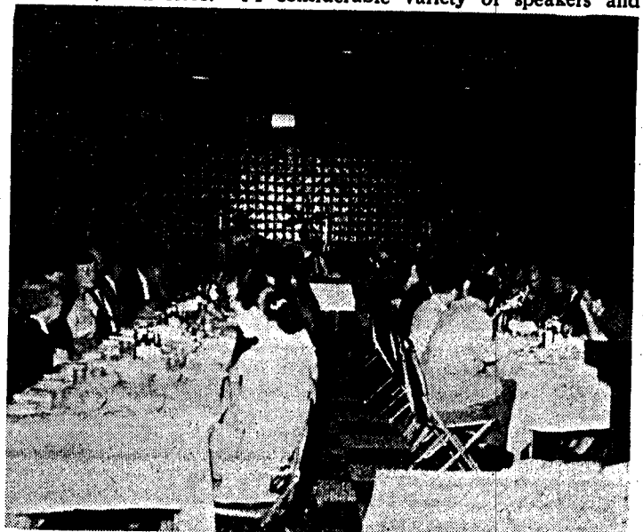
Banquet for conferees was held Saturday evening, in Tubby's Attic, Davis Brother's Restaurant, Atlanta.