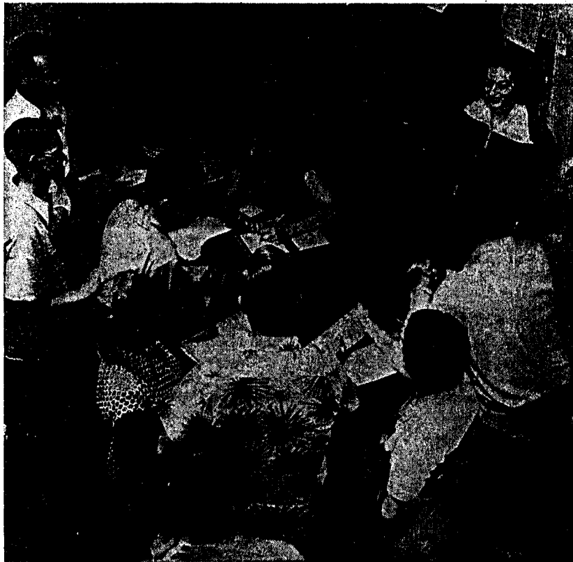
Conference Registration Day

It is indeed a bright future ahead for Dianetics. Its discoveries and applications are being investigated by responsible professional people. From a noisy, clamorous birth, Dianetics