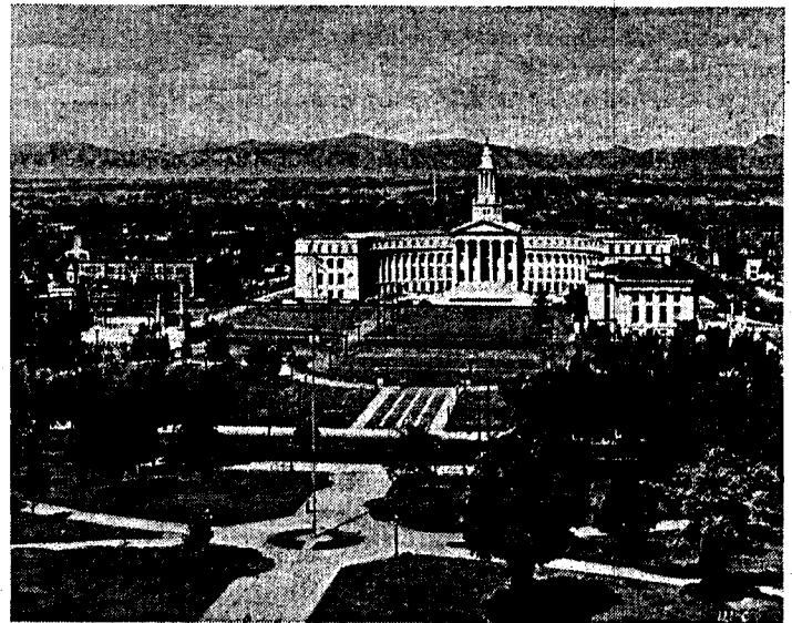
DENVER CIVIC CENTER, looking west from Capitol steps. Within easy reach of the city lie miles of swirling trout streams and scores of crystal lakes.